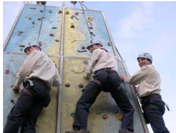
Watching the "experts" on the climbing wall