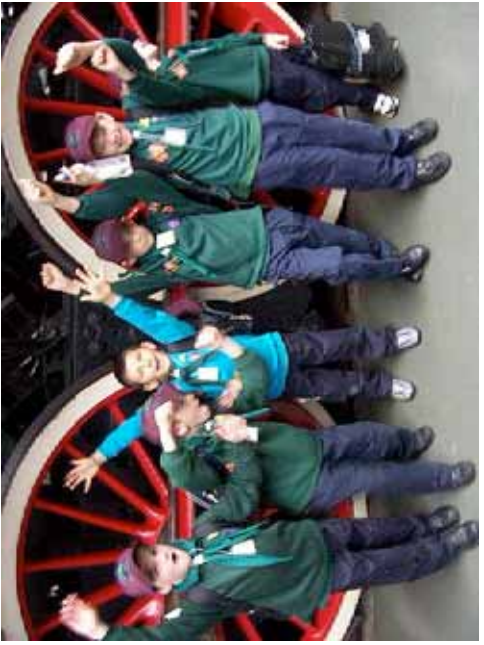
Cub's outing to York included the Railway Museum