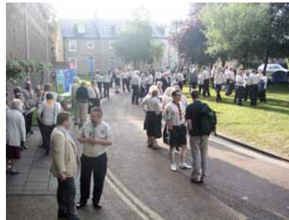
Gathering outside the Maltings, Ely