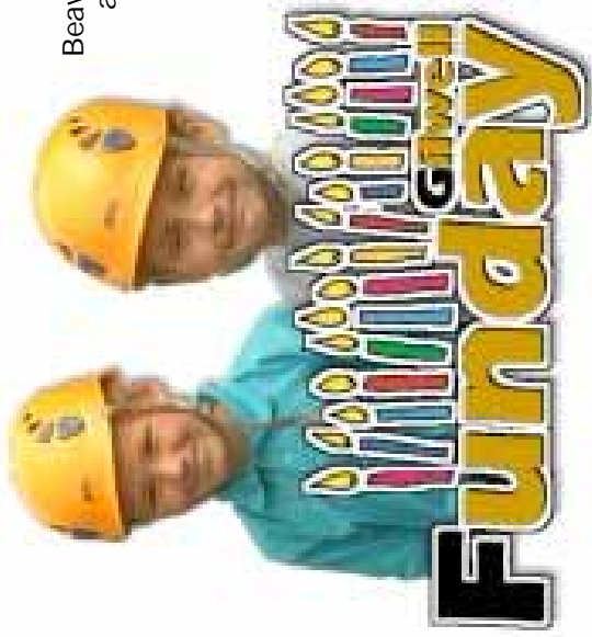
Beaver's Funday at Gilwell