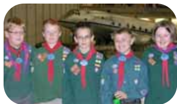
1st Whittlesford & Duxford Cubs and Scouts (left)